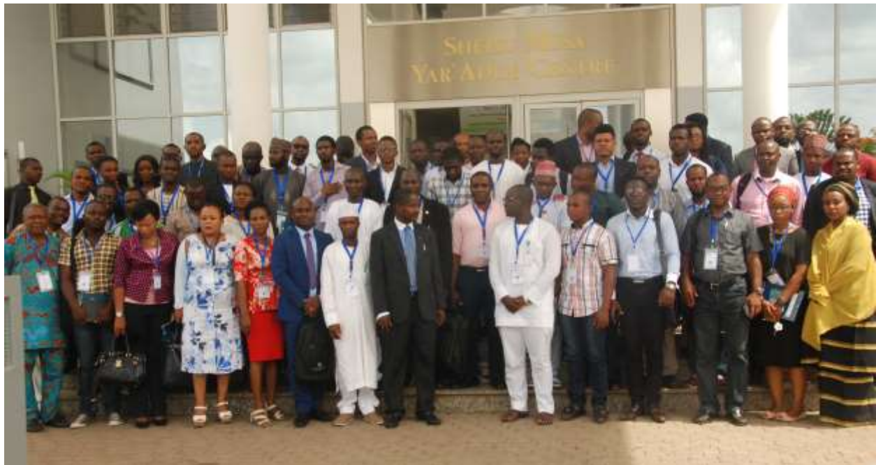
Youths Participants at the Pre-NIGF 2016 Youth Workshop

The turnout at the forum was rather impressive with an attendance of approximately 600 participants with day two of the forum recording the most participants at over 400. Participants were drawn from Information and communication technology experts, security operatives particularly in the area of cybercrime, government officials, students and other representatives of youth groups who witnessed the first day of the event. There were also secondary school students in attendance who made very remarkable contributions and put forth suggestions on ways to encourage more participation from a much younger age.