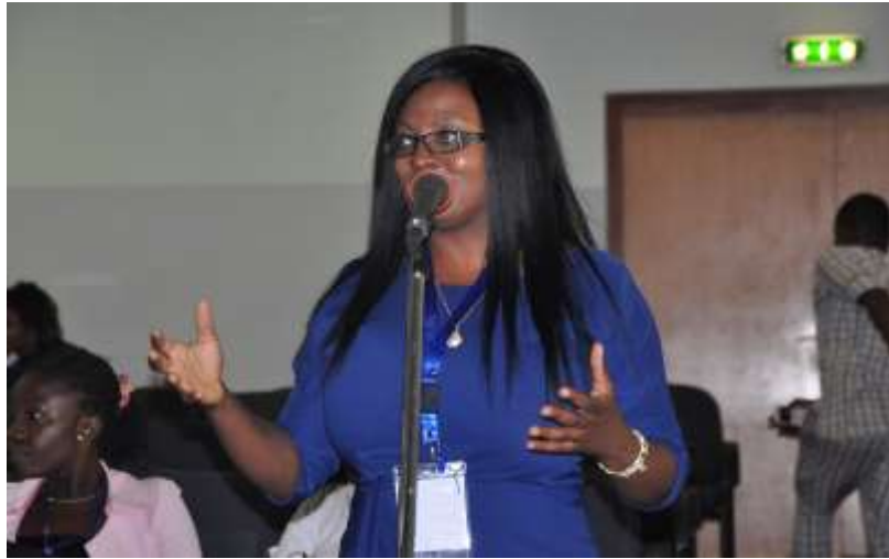
A Participant Asking Questions during the NIGF 2016 Youth Workshop